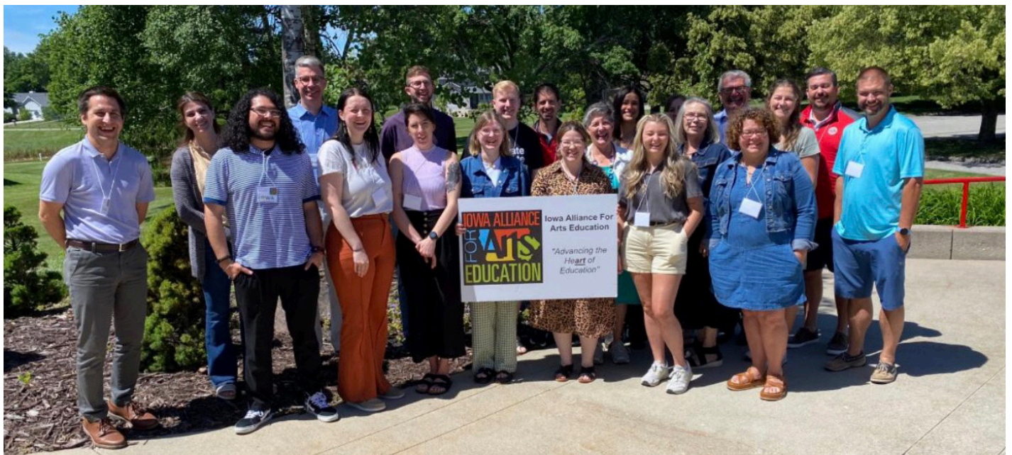
IAAE Leadership Institute Participants, June 2024