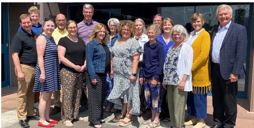
Combined IAAE Executive and Advisory Board Strategic Planning Session, June 2023