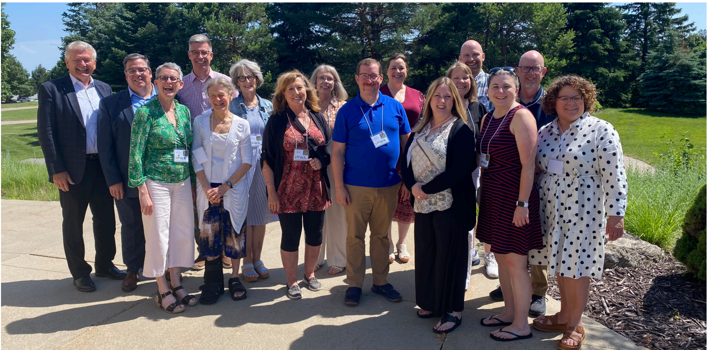
IAAE Executive and Advisory Board Members, June 2024

Fine arts teachers who are involved care passionately about arts instruction in Iowa schools. Our members include a wide variety of other fine arts advocates.