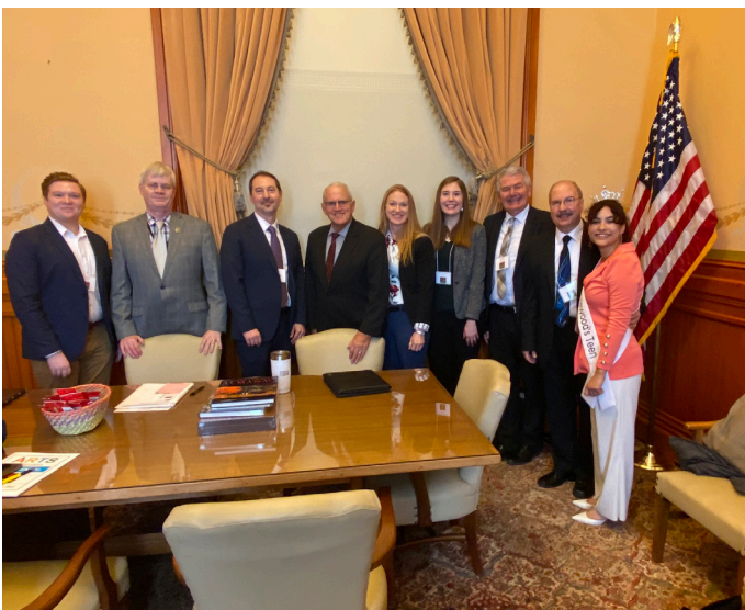
Fine Arts Education Advocacy Day 2024

As a result of our advocacy work, IAAE was able to increase the amount of the state appropriation to $50,000 and that matching funds can include in-kind contributions in addition to cash contributions up to $50,000 a year.