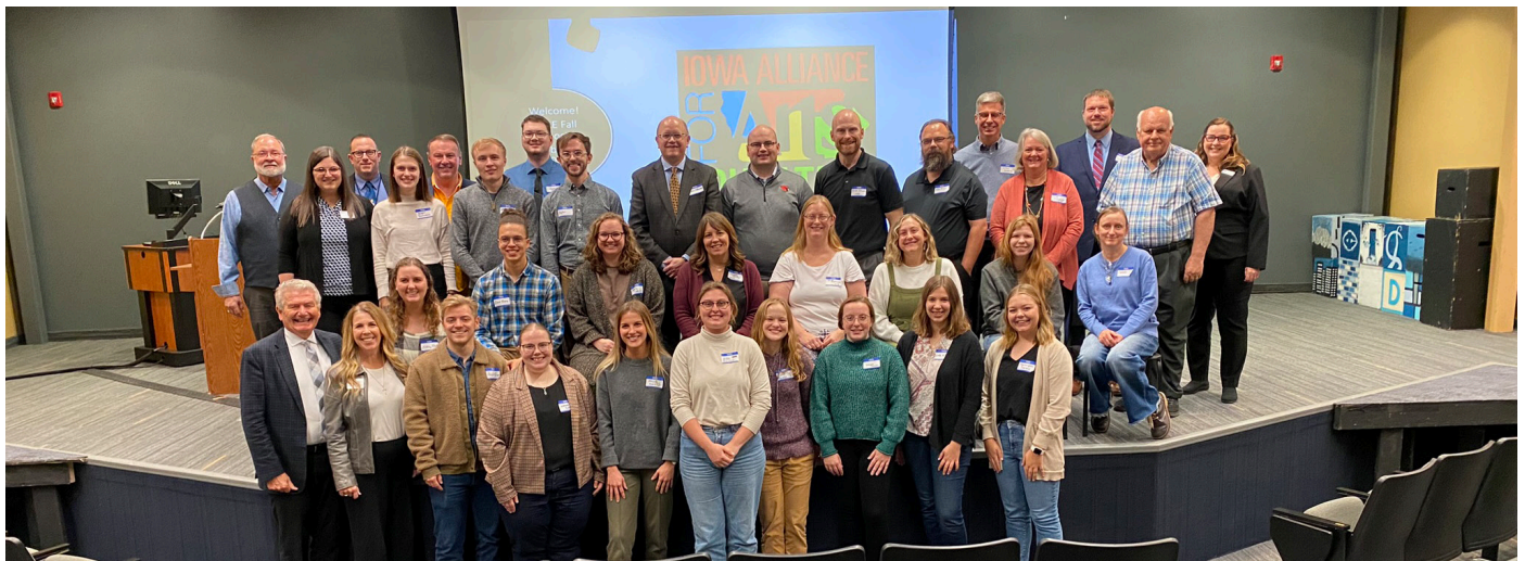
Fall Symposium Participants, October 2023